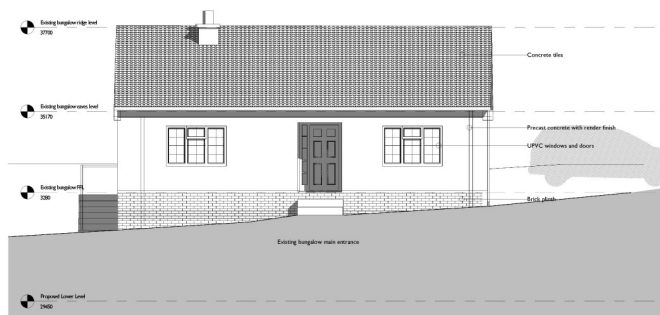
Existing South Elevation